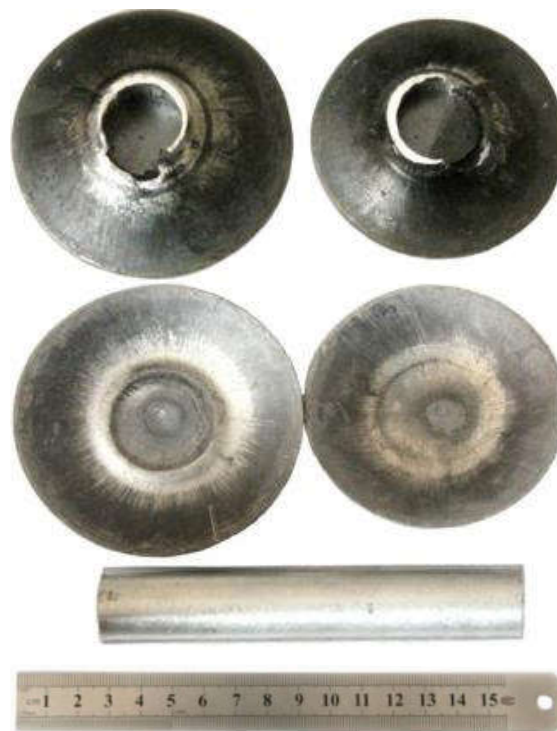
Fig. 2 Initial billet of AM60 and dish-shaped samples fabricated by spread extrusion.

Both the initial and final samples of AM60 magnesium alloy before and after the spread extrusion process are depicted in Fig. 2. It clearly shows that this process can produce samples in which cylindrical billets changed to the final dish-shaped samples.